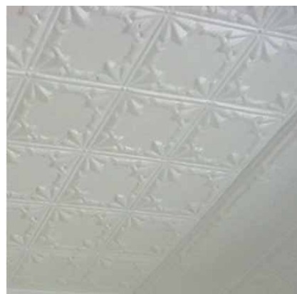
existing tin cielings